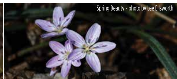
Spring Beauty