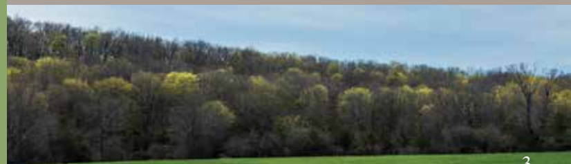
Rocky Ridge’s spring forest