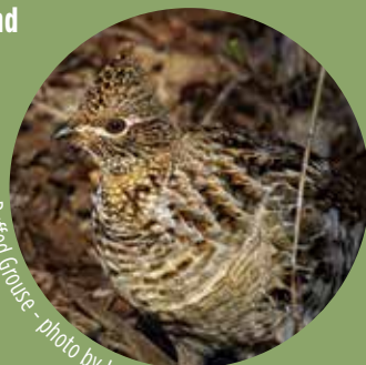
Ruffed Grouse