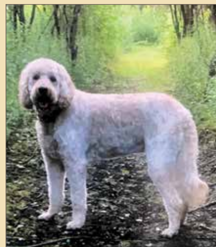
Sadie at Donnybrook