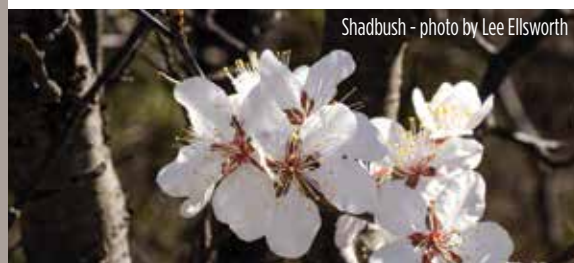
Shadblush