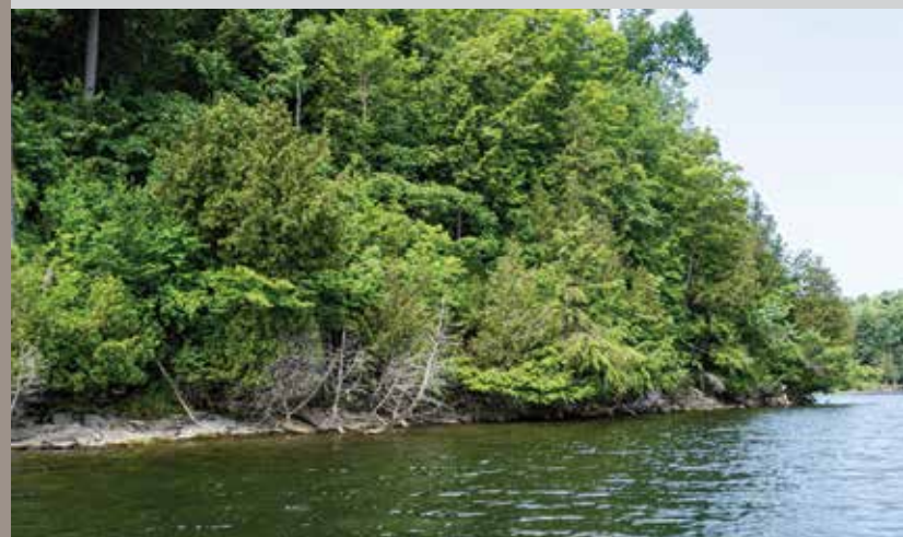
Lakeshore at Stony Cove